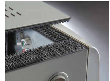
Attach access panels to industrial, electronic and electrical equipment