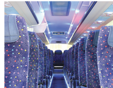
Fasten ceiling panels to interior for future access