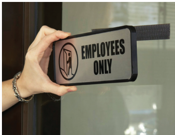
Secure plastic signs to window glass