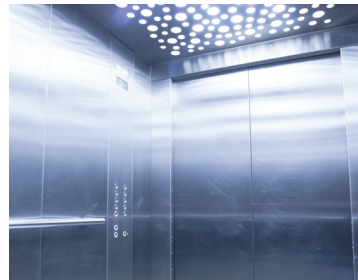
Attach elevator control panel to interior wall