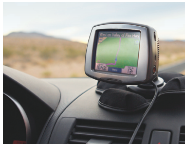
Anchor vehicle accessories to dashboard